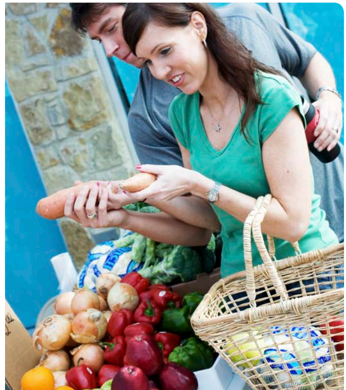
Following a heart-healthy eating plan is a great way to manage your diabetes and reduce other risk factors.